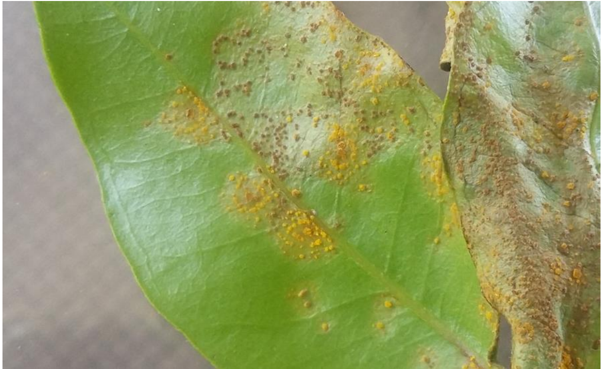
Sexual and asexual pustules on M. communis .

Myrtle rust is known to produce the teliospore stage in New Zealand. This spore stage is different from the asexual urediniospore stage and indicates that the fungus is capable of reproducing sexually. Sexual reproduction introduces genetic variability, increasing the risk to New Zealand, as it allows fungi to adapt to new environments and possibly affect new hosts.