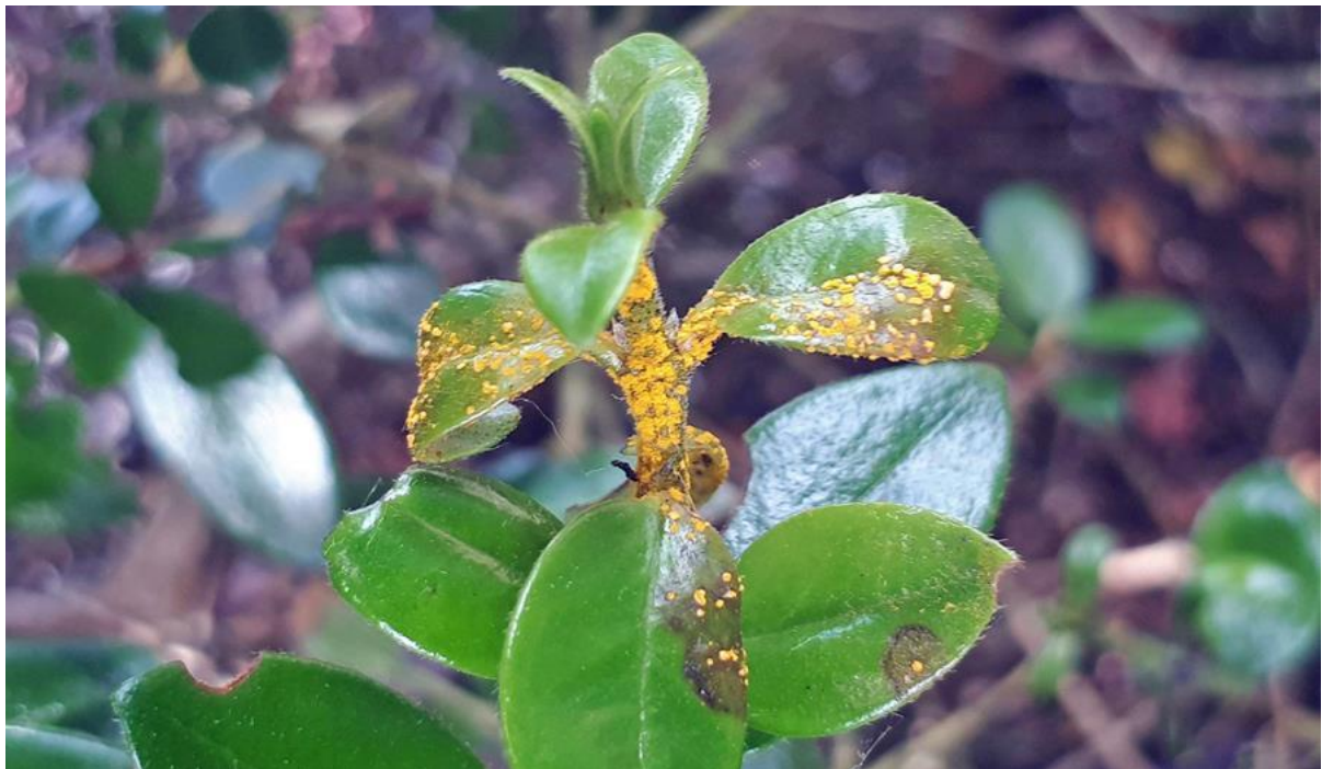
Bright yellow powdery eruptions of spores appear on both sides of the leaf