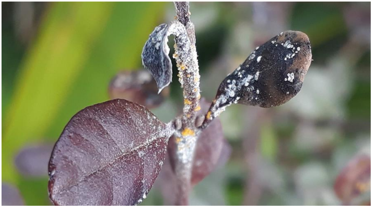
Overtime the pustules darken and become brown-grey