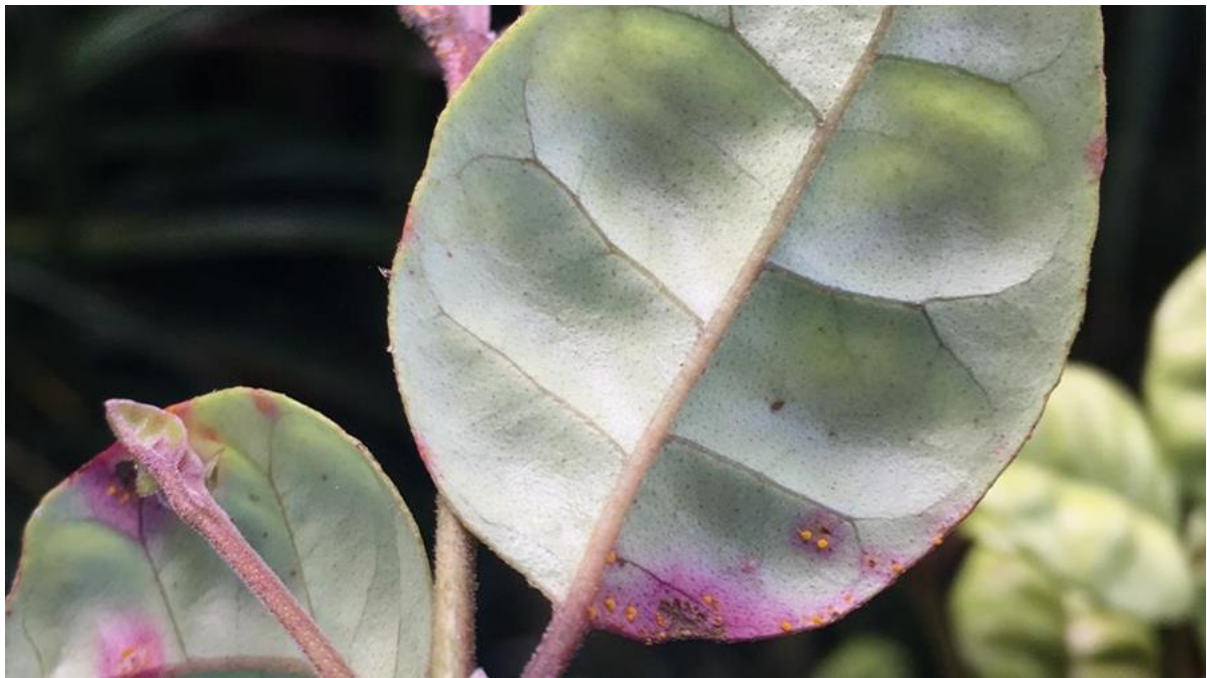
Bright yellow powdery eruptions appear on the underside of the young leaf