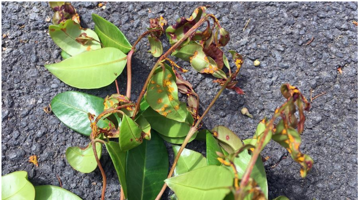
In case of severe infection, leaves may become twisted and die

If you think you see symptoms remember to not touch or collect samples, but take pictures and report it to Biosecurity New Zealand's Exotic Pest and Disease Hotline on: 0800 80 99 66.